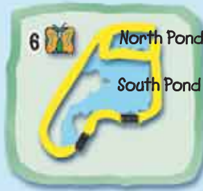
Wawanosh Wetlands Conservation Area